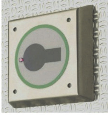
AC-3212 Vandal Resistant