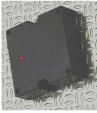
AC-3213 Panel Mount